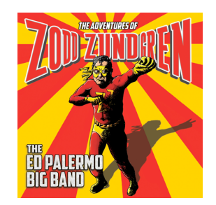
The Ed Palermo Big Band The Adventures of Zodd Zundgren [2017, Rune 440]