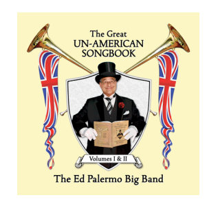
The Ed Palermo Big Band The Great Un-American Songbook Volume I & II [2017, Rune 435/436]