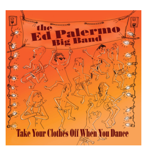
The Ed Palermo Big Band Take Your Clothes Off When You Dance [2006, Rune 225]